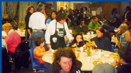
After eating a hot meal, warm, safe beds await those in need in the Mission's overnight shelter program.