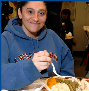
Safe from the cold, a hot meal brings a smile to the face of one of our overnight guests.