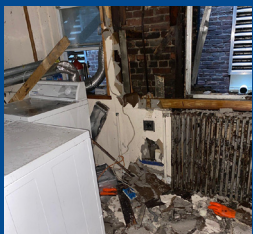
Firefighters fought to contain the fire to the back alley and the Mission's laundry facilities.